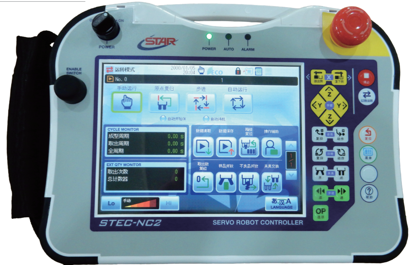
ES-II系列操作盒 | ES-II SERIES CONTROLLER